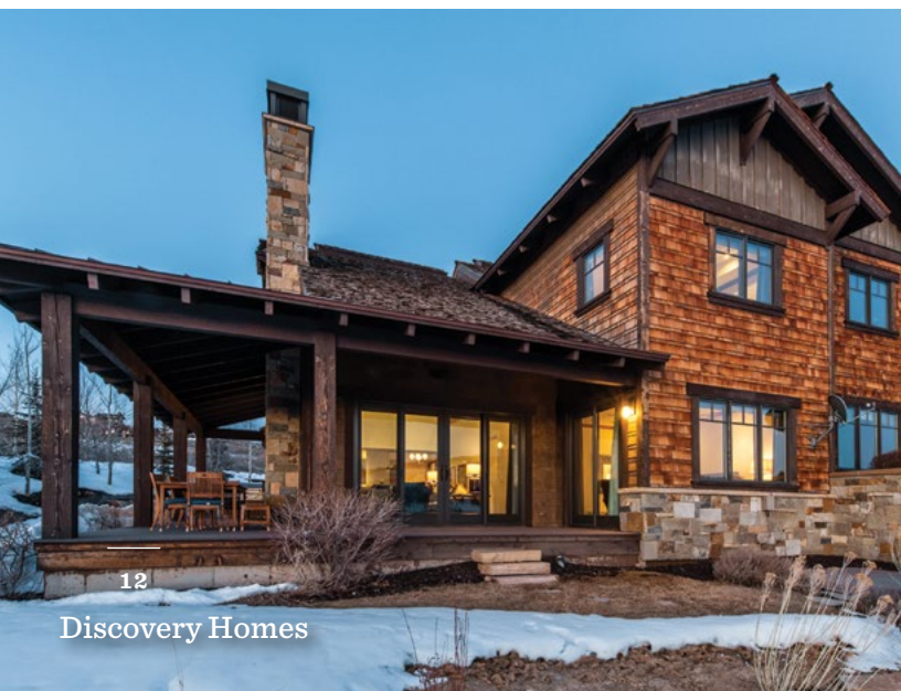
12 Discovery Homes