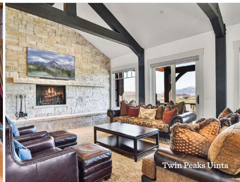
Twin Peaks Uinta