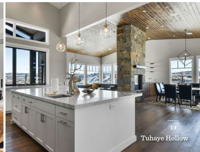
13 Tuhaye Hollow