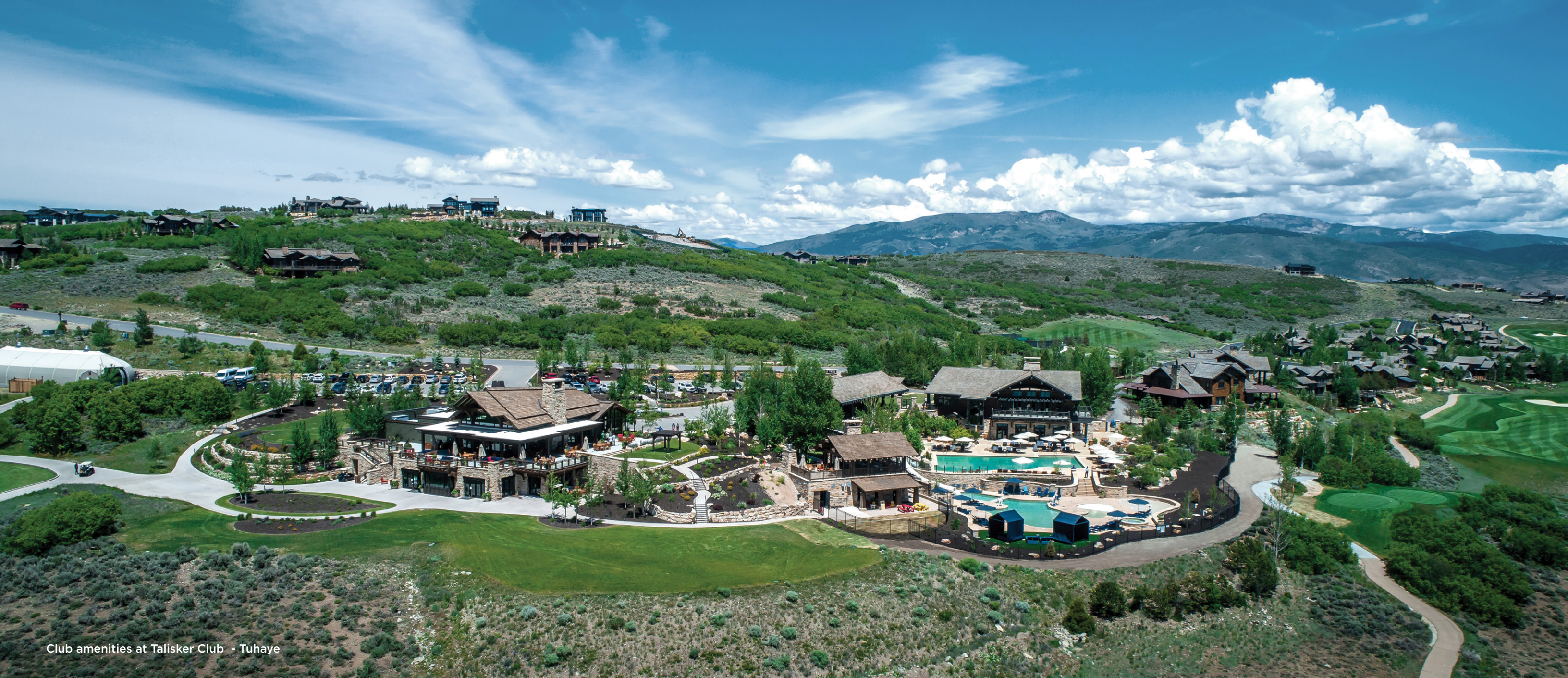
Club amenities at Talisker Club - Tuhaye