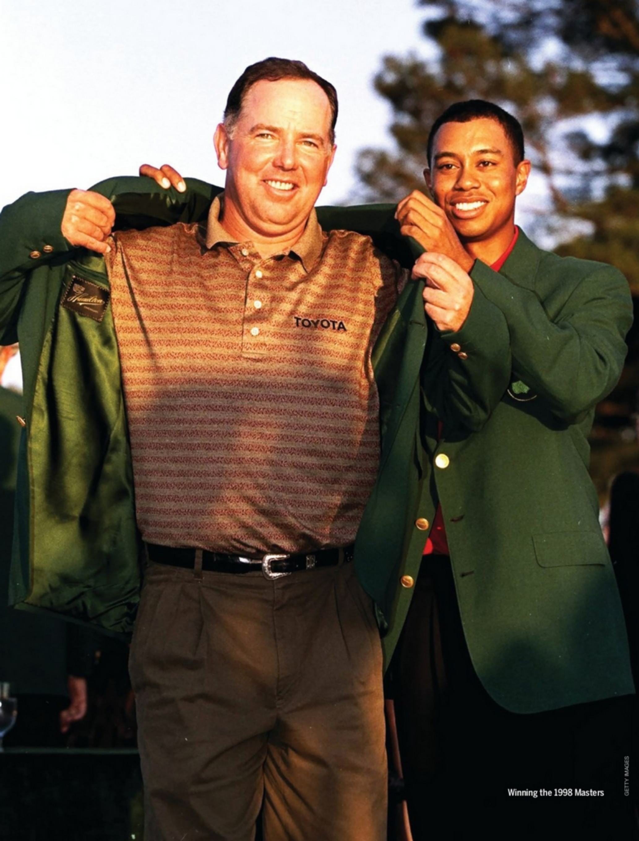
Winning the 1998 Masters