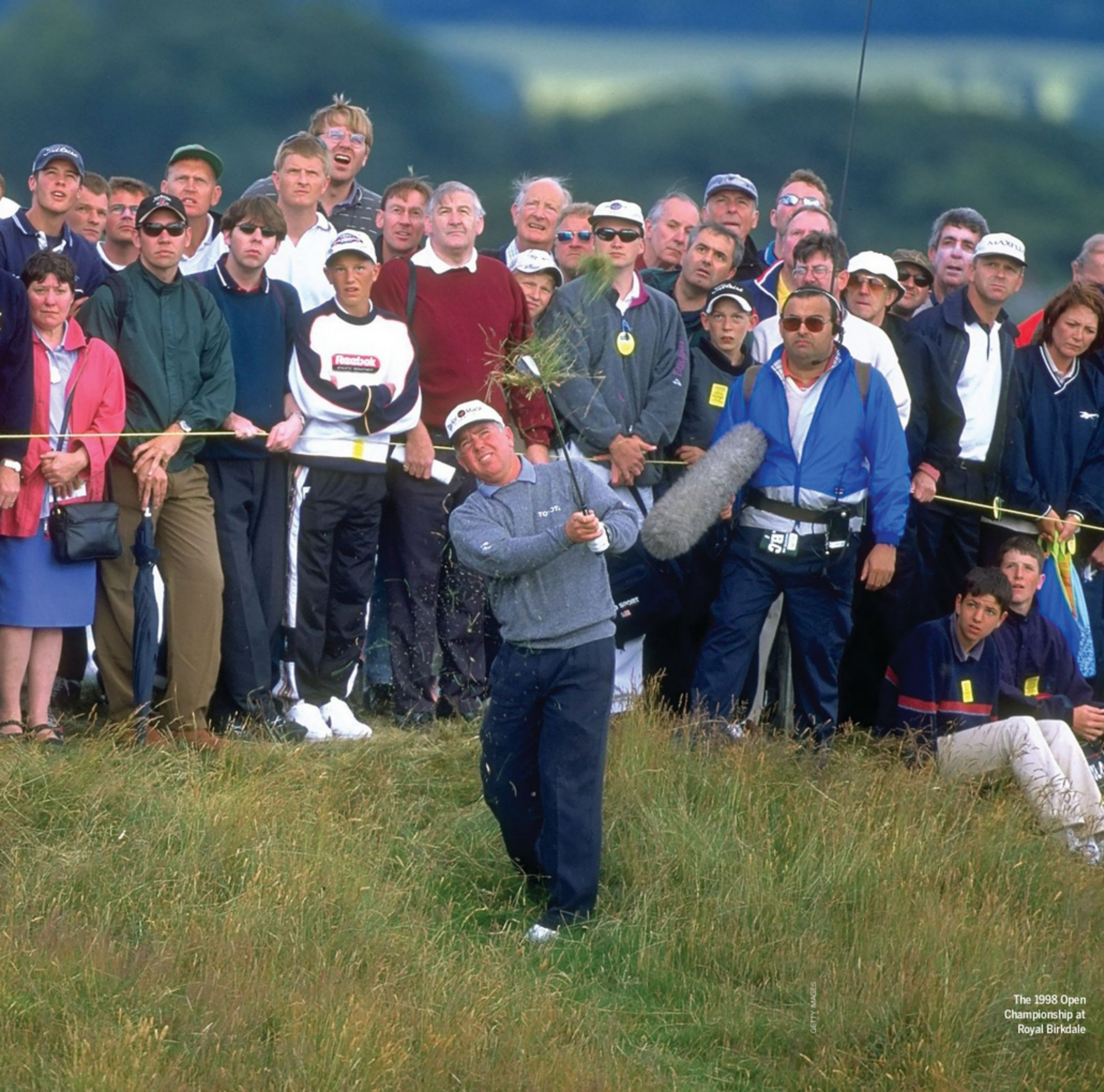
The 1998 Open Championship at Royal Birkdale