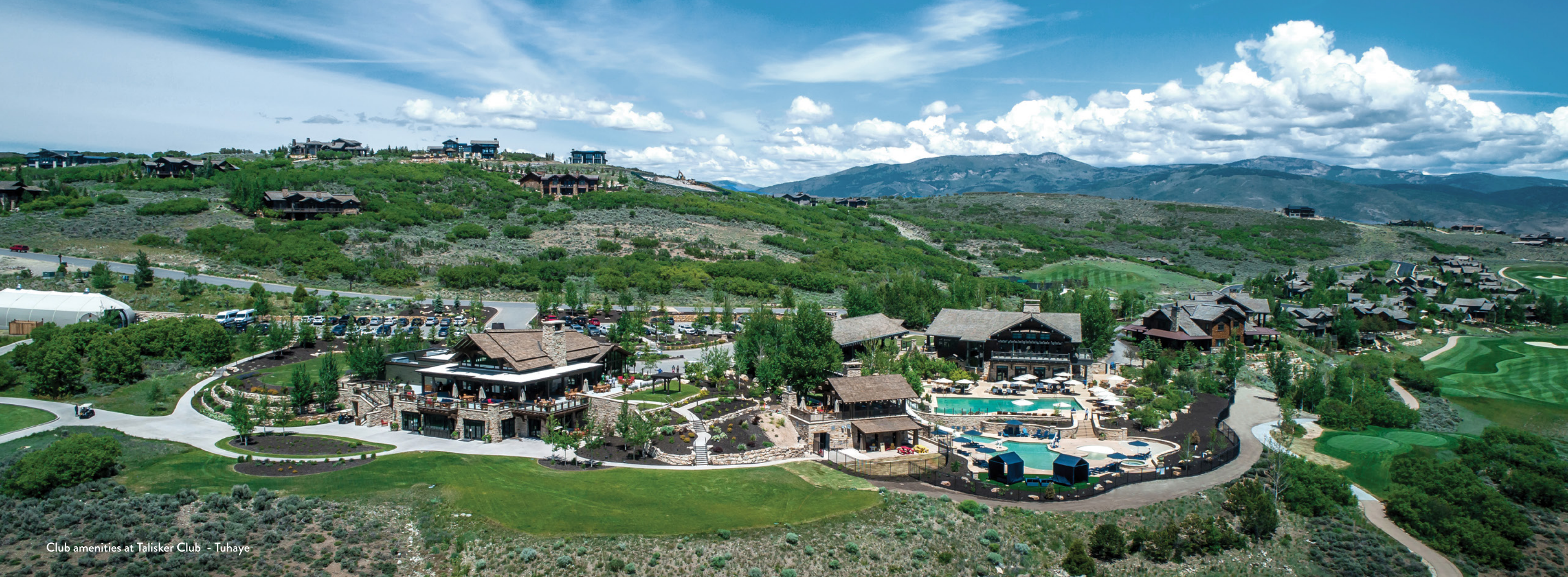
Club amenities at Talisker Club - Tuhaye