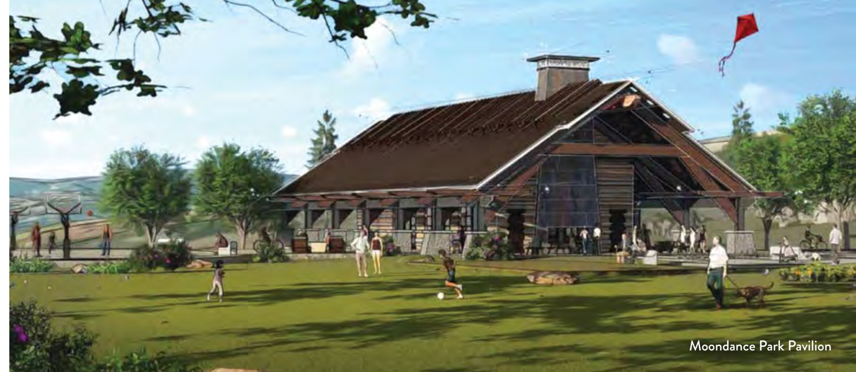
Moondance Park Pavilion

Perched high on a ridge overlooking Jordanelle Reservoir, the environs of this planned upcoming rustic hideaway are anticipated to include cozy gathering places, an intimate eatery and bar, and covered outdoor decks with fire pits.