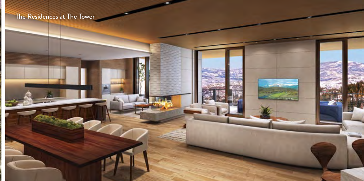
The Residences at The Tower