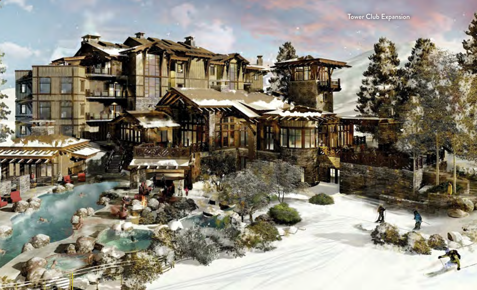
Tower Club Expansion