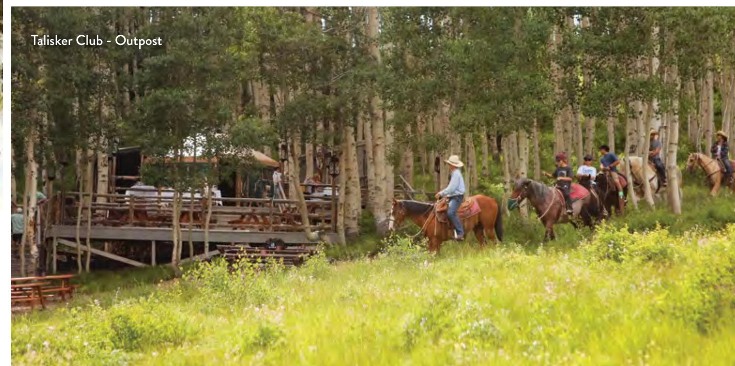
Talisker Club - Outpost