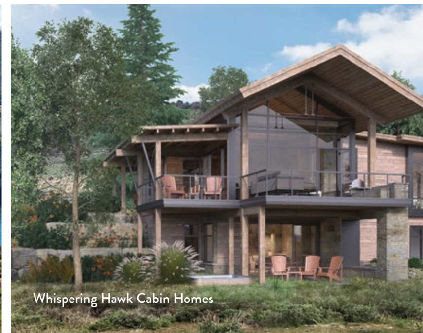
Whispering Hawk Cabin Homes