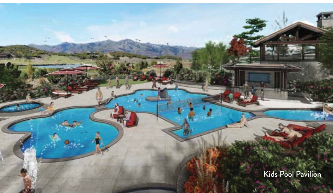
Kids Pool Pavilion