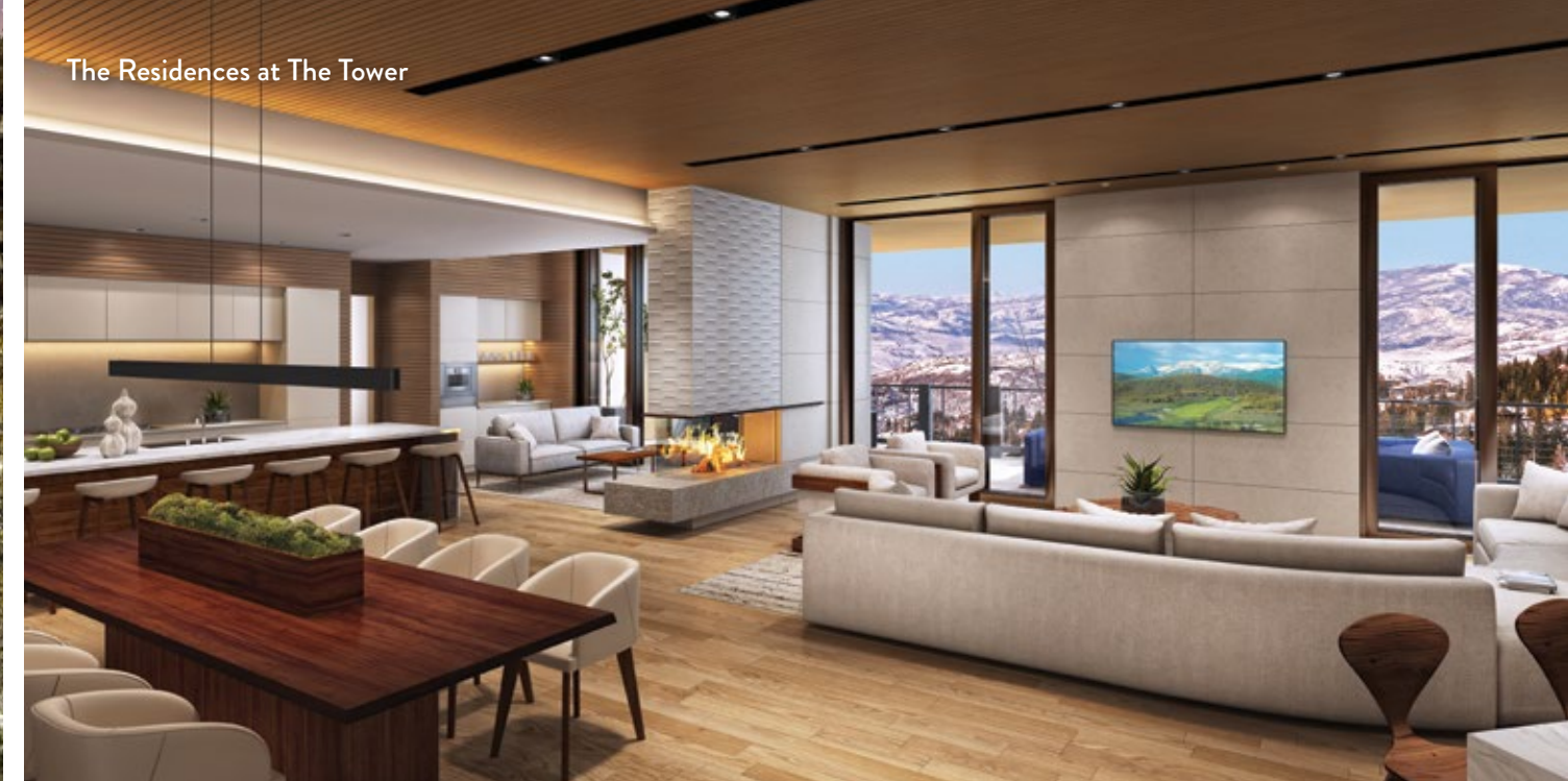
The Residences at The Tower