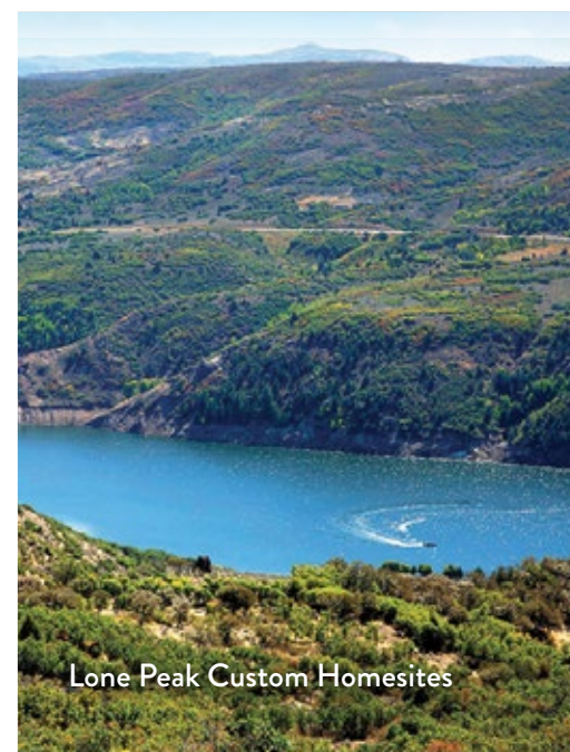
Lone Peak Custom Homesites