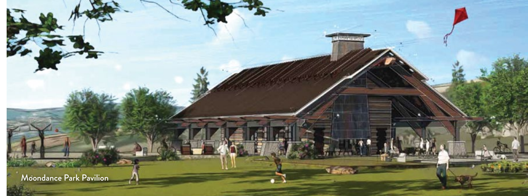
Moondance Park Pavilion

Situated along the emerald fairways of the Mark O'Meara 18-Hole golf course, Morningstar gives you the opportunity to enjoy Talisker Club membership through fractional ownership.